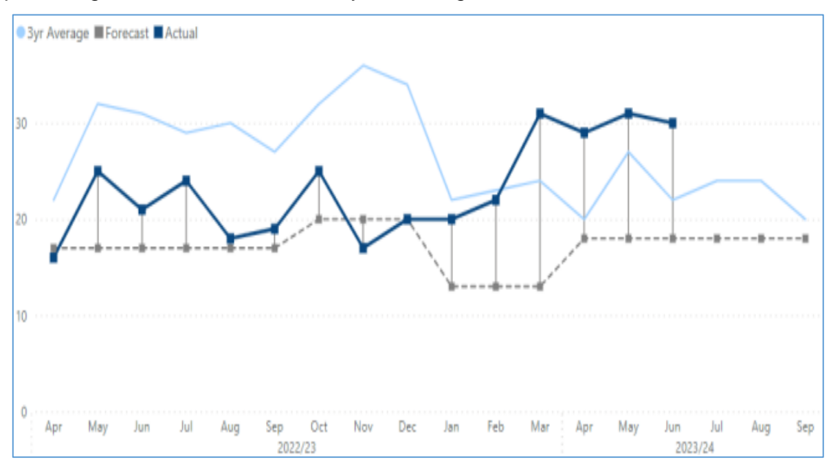
Figure 2 – Theft from Person Volumes

In Q1 2023/24, volumes have remained stable but are significantly above the preceding months and above the 3-year average and the forecast.